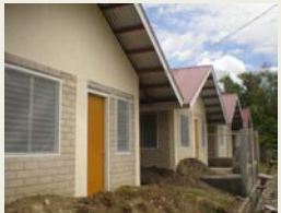
Housing in the Philippines: Trends, Policies & Programs:

The Integrated Shelter Delivery Program is anchored on five-course modules designed to address the major facets of shelter delivery. This is formalized in course format for capacity-building adaptation by Higher Education Institutions and Local Government Units.