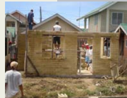
Earth Architecture & Construction Management:

An introduction to several alternative construction materials and technologies that were proven to be cost-efficient, environment-friendly and socially-acceptable. The use of local materials and local skills are emphasized with the development of local business enterprises.