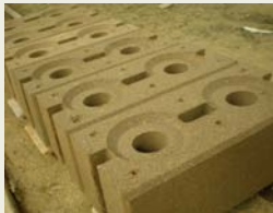
Alternative Construction Materials & Technologies:

The course is aimed to provide a better understanding on the housing situation in the Philippines with specific discussion on the nature and mechanism of the National Shelter Program as well as performance.