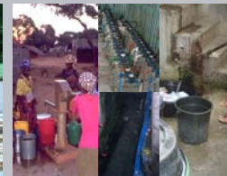
Water Supply & Sanitation:

The course deals with the four core methodologies involved in emergency preparedness and response: Emergency Contingency Planning, Emergency Operation Planning, Incident Action Planning and Demobilization Planning covering the before, during and after phases of emergency planning and management. The course emphasizes the importance of political, inter-agency and multi-jurisdictional issues as well as incident stress.