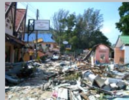
Disaster Risk Management & Response:

A new look at the oldest building material on the planet - earth. It discusses the different types of building designs and construction using earth as the primary material with specific concentration on adobe, compressed earth blocks and interlocking compressed earth blocks.